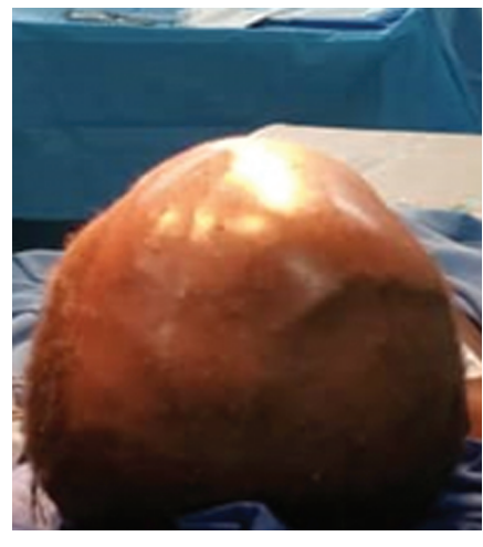
Fig. 1 Macrocrania with right frontal swelling (preoperative).

Described in 1921 by James Ewing, Ewing's sarcoma is the most common primary malignant bone tumor after osteosarcoma in young people. In 90% of cases it occurs in the first or second decade of life with a slight male predominance. These