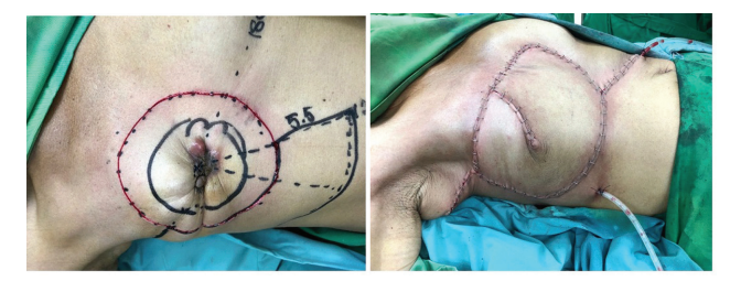
Fig. 5 A 55-year-old patient with invasive breast cancer underwent radical mastectomies with 11-cm diameter of primary defects, 5.5 cm of adjacent tissue radius was used to close the defects using a horse-shoe flap.

A 50-year-old patient (patient C) was presented with multiple palpable masses in her right breast. She was diagnosed with invasive breast cancer, ductal carcinoma with triplenegative molecular type. Six series of neoadjuvant chemotherapy were done but did not seem to show any improvement clinically. A horse-shoe flap design was planned for reconstructing the chest wall after we dissected the remaining tumor on her right breast. We shaped and designed a circular defect with 11-cm diameter. This length was considered necessary and expected to leave a safe margin. With 11 cm of primary site defects and 120-degree angle from the center of circular defects, 5.5 cm of adjacent tissue outside the primary defect was sufficient to cover the defect. We removed all tissue from the circular area and preserved the pectoralis minor muscle. The reconstruction was successfully done, leaving with minor scar tissues ( > Fig. 5). The patient was followed-up until 1 month after discharge, and there were no surgical complications.