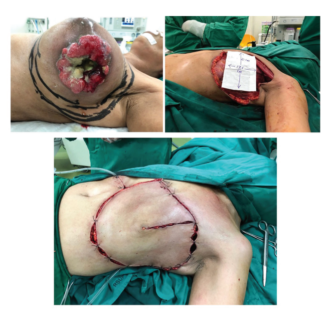
Fig. 6 A 52-year-old patient with 21 \times 17 cm<sup>2</sup> of the primary defect after radical mastectomy underwent a horse-shoe flap using 10 cm of skin outside the defect for closure.