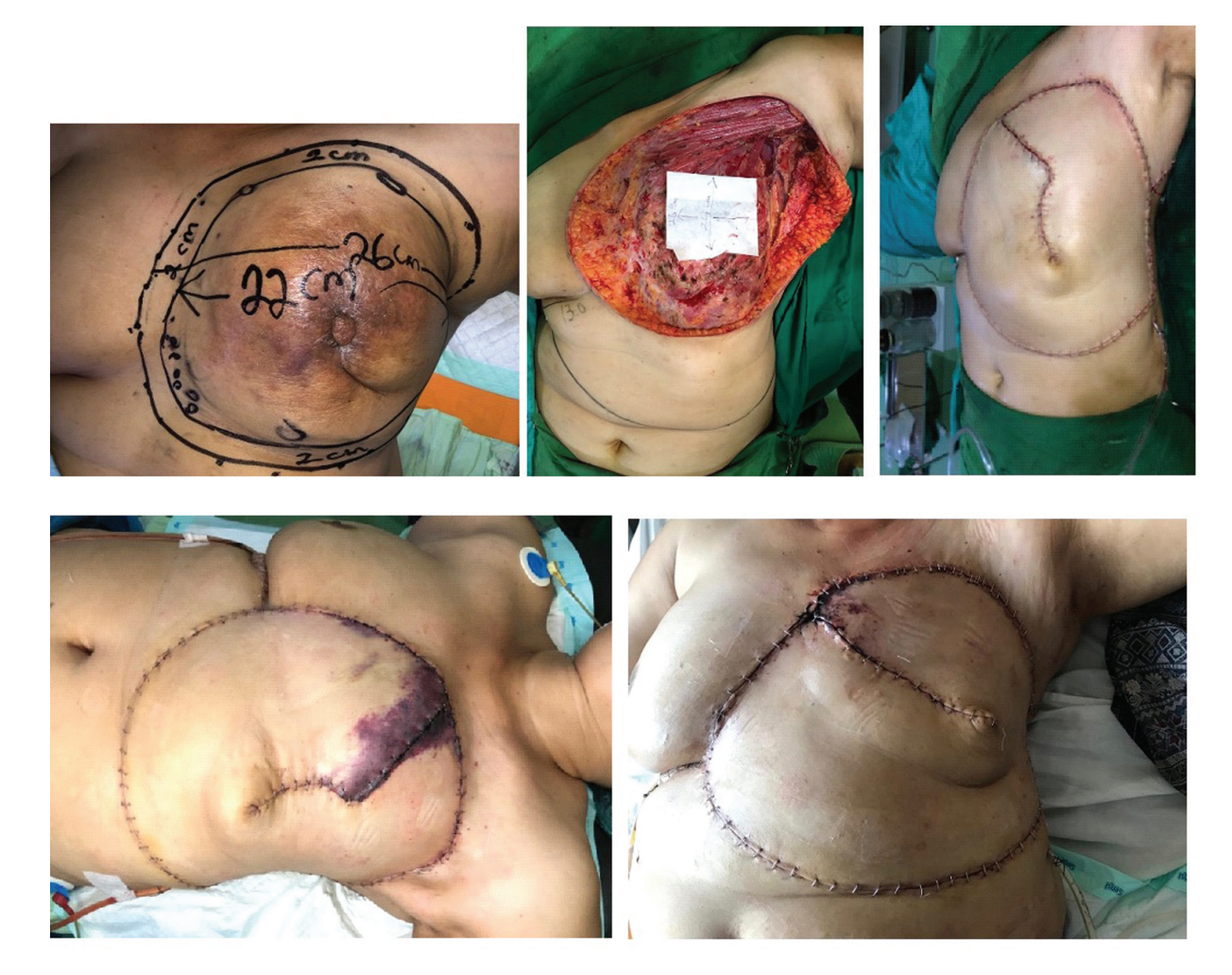
Fig. 7 A 55-year-old patient with the largest defect in this study underwent horse-shoe flap using 13-cm adjacent tissue below the defects. Marginal necrotic skins were found after surgery, and reexcision of necrotic skin was necessary, followed by stitching both edges for closure.

The easiest way, but no longer used by many experts, for chest skin coverage is split-thickness skin grafts (STSG). STSGs are widely known and best used for relatively minor and small skin defects with sufficient vascular beds. However, STSG for chest wall closure takes longer to heal (in