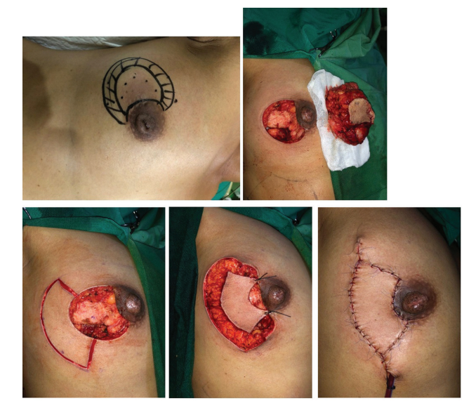
Fig. 3 A 45-year-old patient with small phyllodes tumor on her right breast underwent horse-she flap reconstruction using 120-degree angle from the center circle and 2-cm defect radius.

A 36-year-old patient (patient B) presented to our surgery polyclinic with a large mass located in the lower medial quadrant of her left breast. An excision biopsy was done before admission from another hospital, and the histopathology result showed a phyllodes tumor, similar to the previous patient but bigger in diameter size. She was offered a choice to remove her left breast entirely, including her solid mass from her previous hospital, but the patient refused and wished to preserve her left breast while removing the tumor. Thus, the patient was referred to our care and we decided to perform wide excision of the tumor and close the chest wall defect with horse-shoe flap reconstruction to preserve the left breast. Wide tumor excision was done, and a defect of