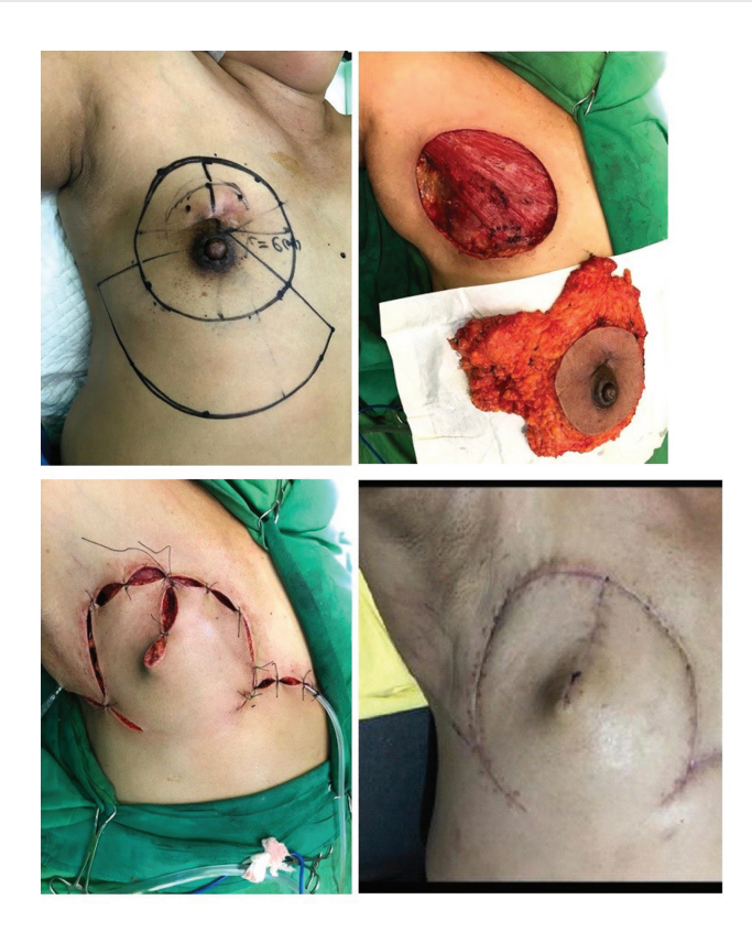
Fig. 2 Surgical steps on performing horse-shoe flap using outer circle adjacent tissue as donor flap.

To facilitate determining the length of the donor flap, there are three basic choices of central circle angle and the length of donor flap needed for closure. The three central circle angles mentioned before are 180, 120, and 90 degrees. If we use 180 degrees as our circular center angle, we only need 73% of defect radius as donor flap length. If we used 120 degrees as our circular center angle, we need the length of defect radius as donor flap length.