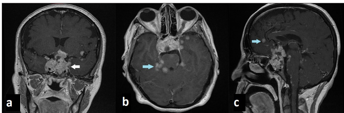
Figure 2: Brain MRI in T1 weighted images with gadolinium shows pituitary carcinoma (white arrow) with brain metastases and meningeal enhancement (blue arrow).